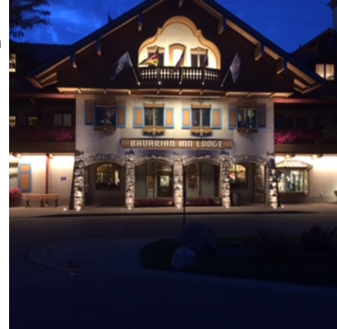
The Bavarian Inn Lodge

The challenge of this project was taking old controllers from an existing building and changing its operation. ATIGROUP provided an abundance of services for the Bavarian Inn Lodge. The project had an ideal result and left them with great designs and outcomes. Our main solution for the Bavarian Inn Lodge was an upgrade to their Building Automation System. We have a long lasting relationship with this company that has helped our work with them become successful. They are a business of serving people a fun and family oriented vacation. It was our duty to take care of their HVAC controls and maintain them so they can provide their mission to their customers.